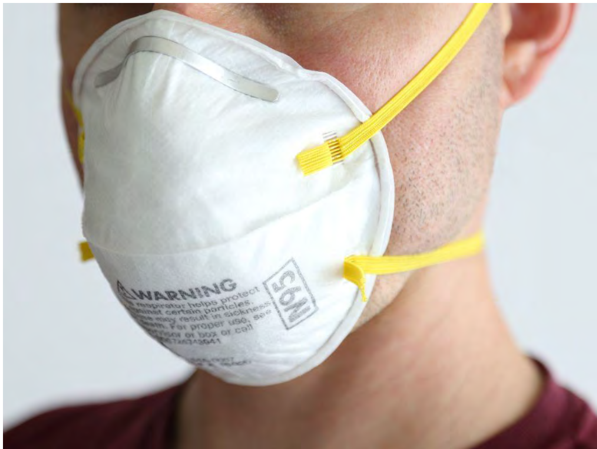
A man is shown wearing an N95 respirator mask, which is not intended to be reused.

These masks aren't healthy to reuse, period. But some medical professionals have to right now.